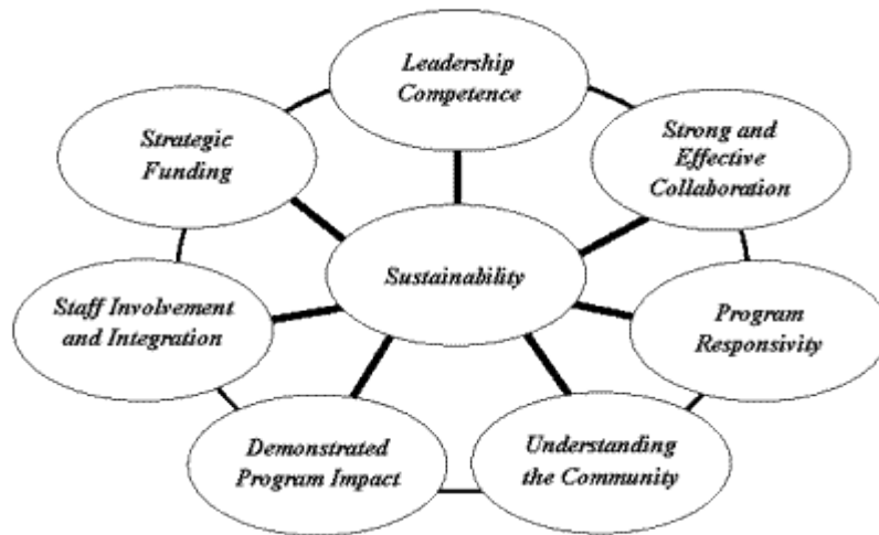
Figure 1. The seven major elements of program sustainability